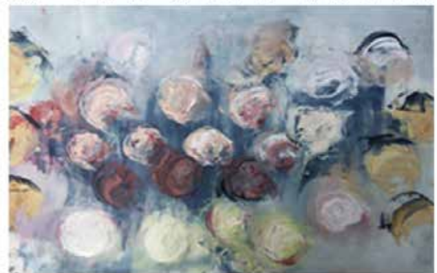
C a t h e r i n e R a m e y

began to explore different mediums, carving wood and stone, continuing to sculpt in clay and wax and began exploring ceramic sculpture.