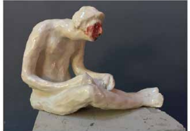
I N T H E S A M E W O R L D